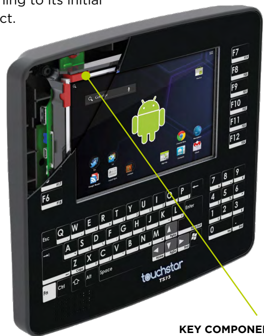
KEY COMPONENTS SHROUDED IN SORBOTHANE®

Other design features that make this TS73 the most rugged terminal in its class: